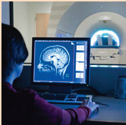
A researcher scans a subject at the Martinos Imaging Center at MIT.

“The goal of the Simons Center is to advance new ways to understand and treat autism spectrum disorders, by fostering novel and unusual collaborations across MIT and Boston-area institutions.”